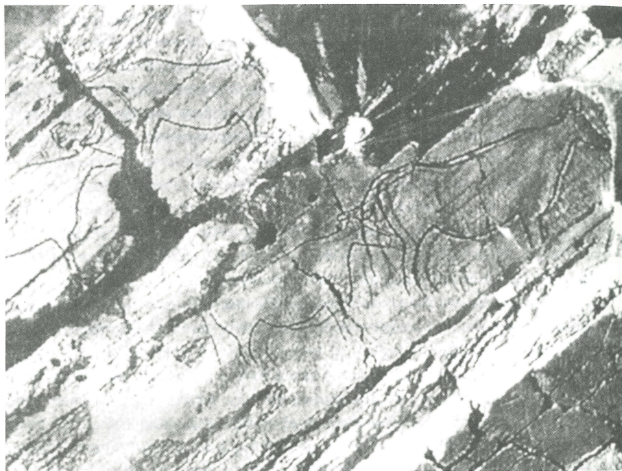
Auroques. Canada do Inferno.